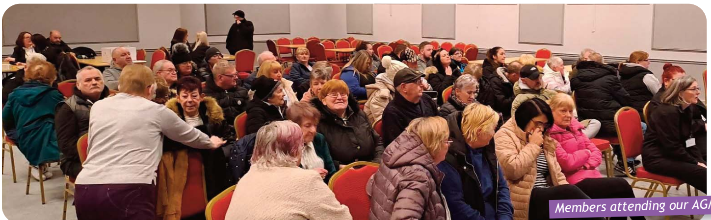
Members attending our AGM